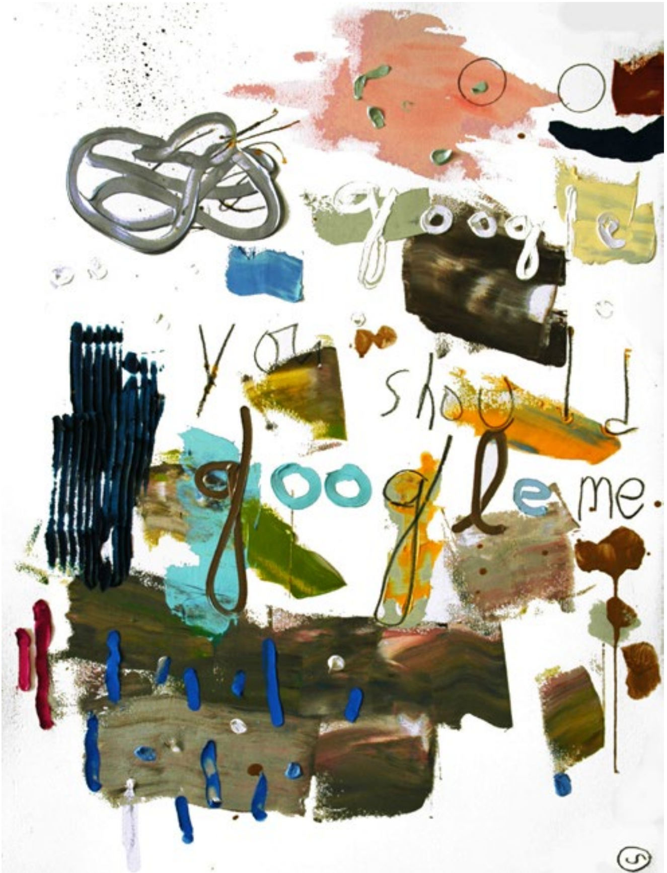
GOOGLE ME, 2014, oil and graphite on paper, 76x56 cm

About a year and a half ago the words in the text-driven oil paintings that I had been making started becoming more sparse. Eventually they disappeared, giving way to gestures and marks, to a painterly abstraction, involving a more physical painting process.