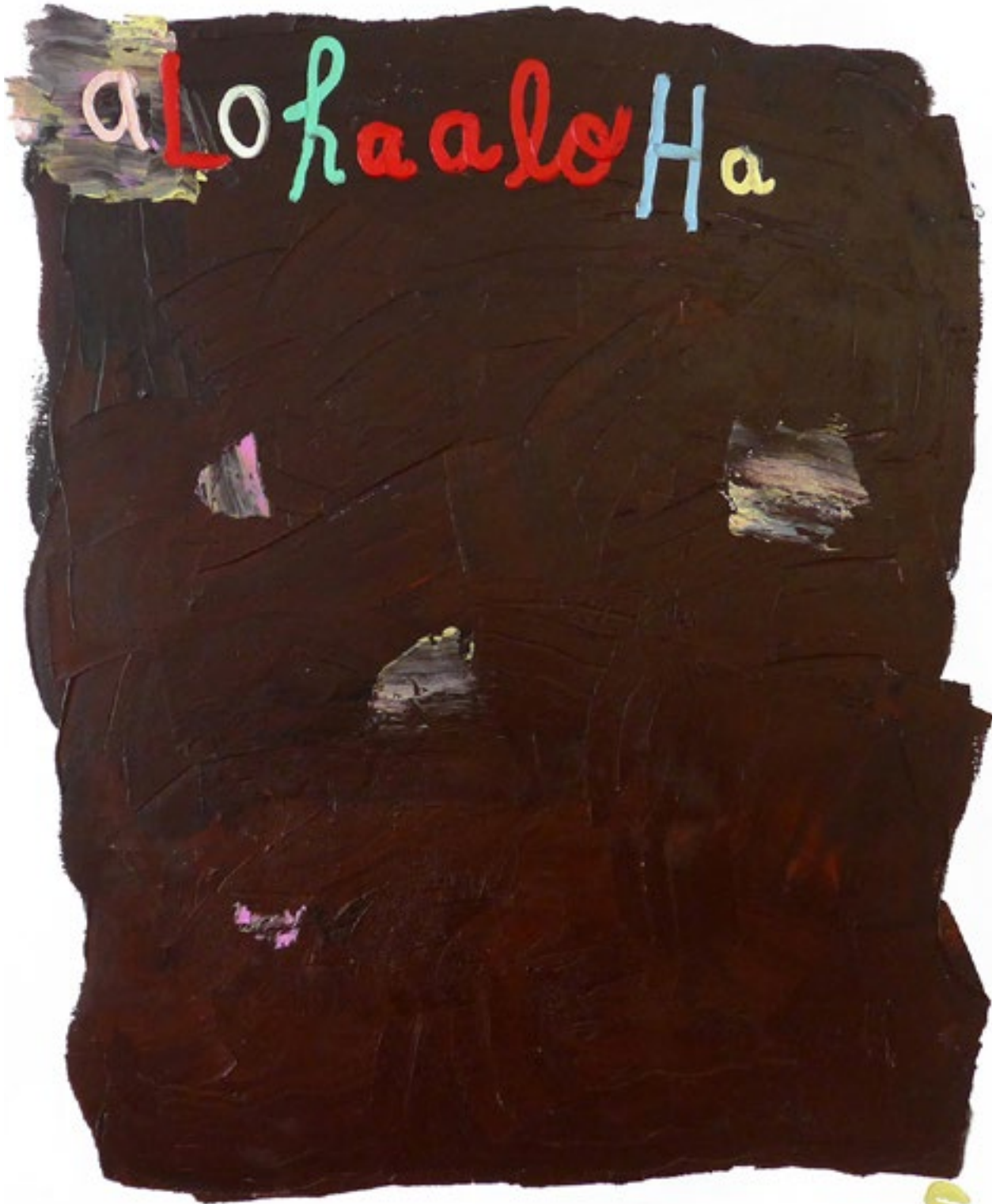
ALOHA, 2015, huile sur toile, 100x81 cm