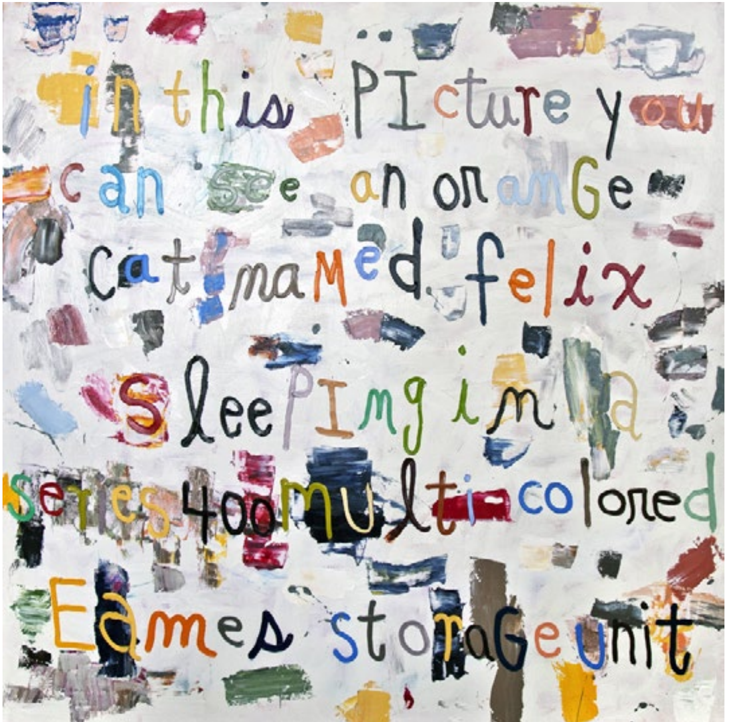
FELIX, 2013, oil on canvas, 120x120 cm

I organize my work in series, and over the years these series have regularly morphed into one another. I like painting in different ways, but usually not simultaneously – I concentrate on one group until I'm done. Often it's a conscious choice to change direction, but not always – things just happen. Transitions occur. It's a luxury that I allow myself. I don't have to get stuck. Though everything is related, anything is possible. It keeps me interested, inspired and in the studio.