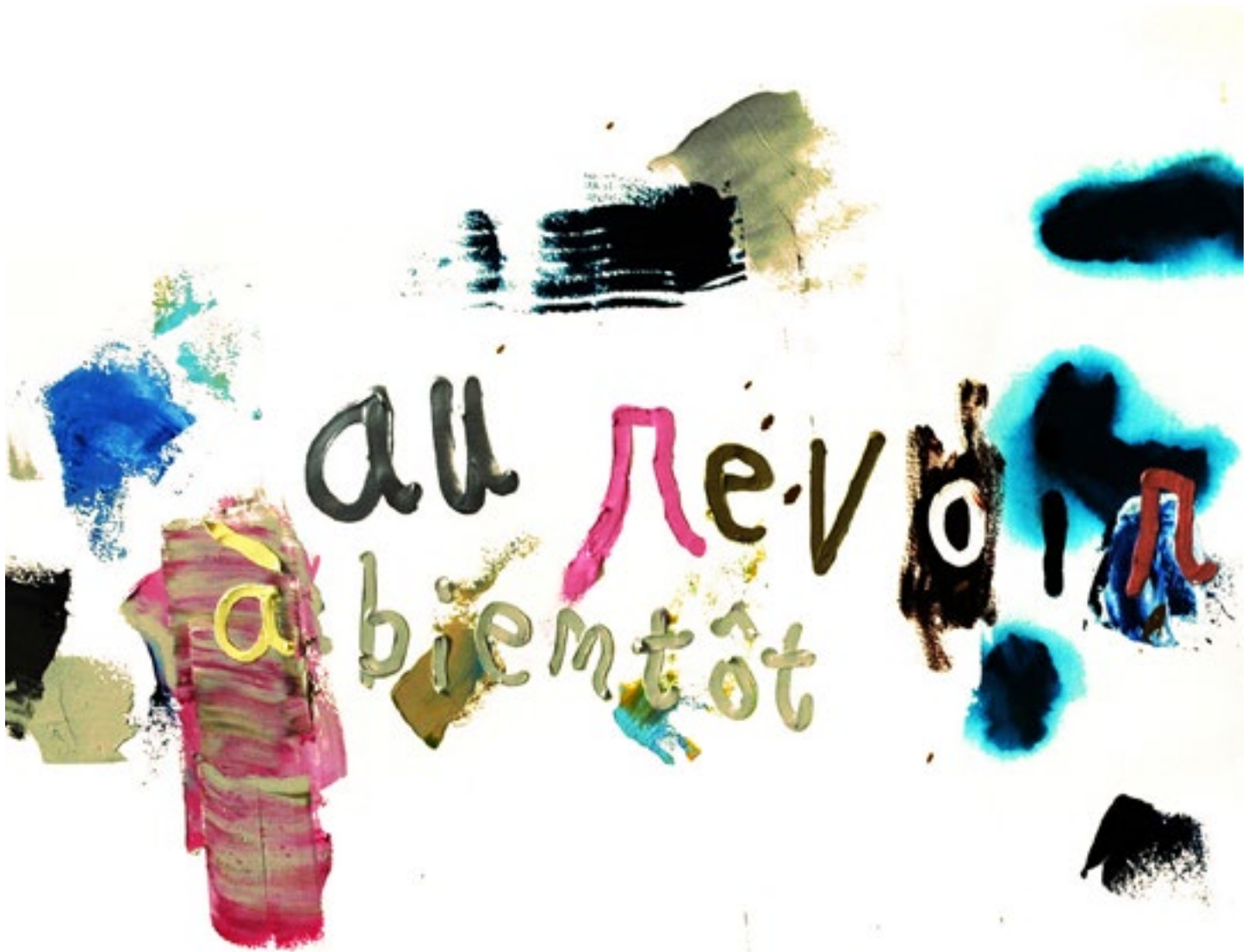
AU REVOIR À BIENTÔT, 2014, huile sur papier arches, 56x76 cm