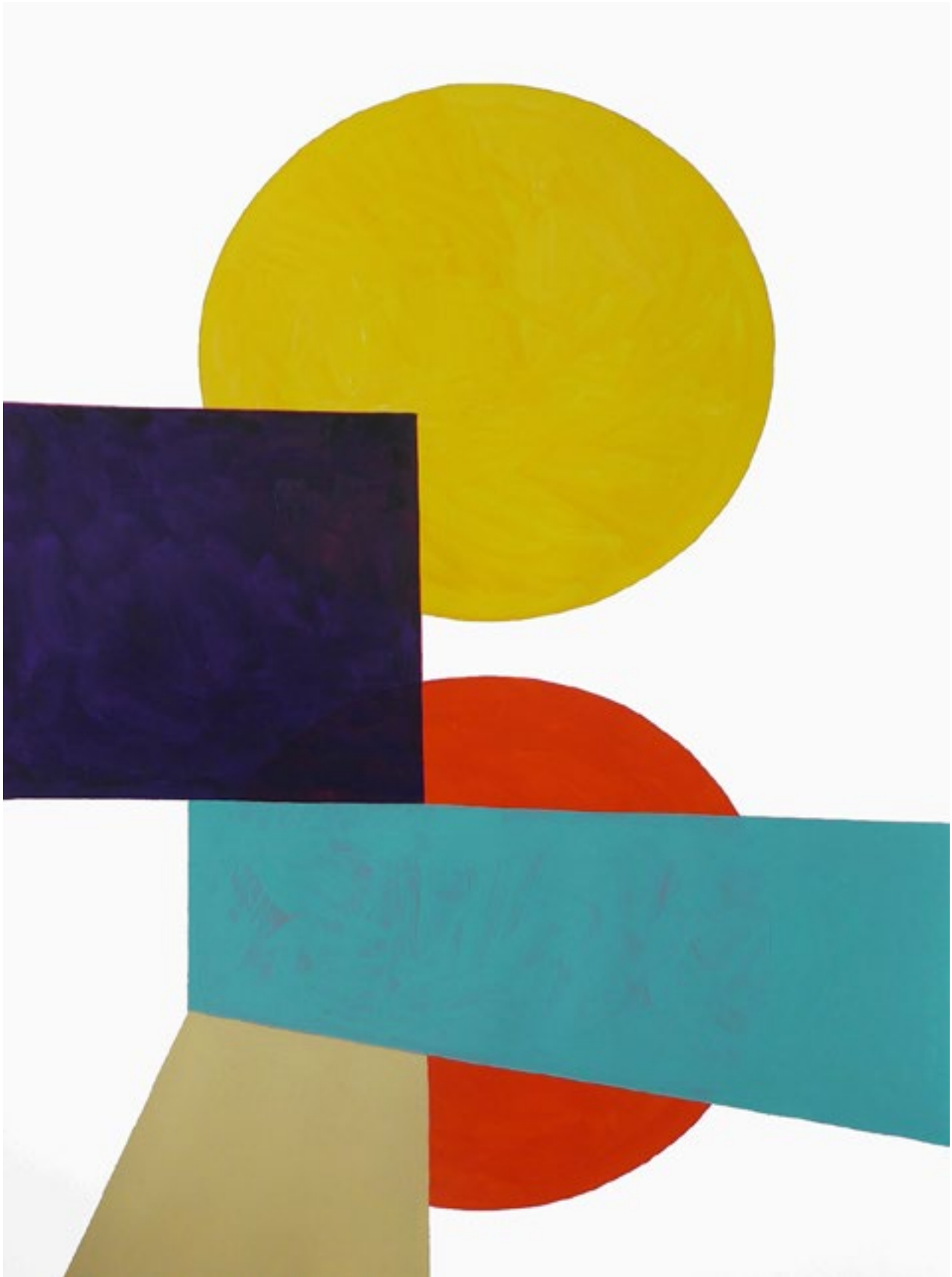
SERIES B8, 2014, mixed media on paper, 110x75 cm

One day In 2014, I sat down at my drawing table and made the first of what turned out to be a series of fifteen simple, geometric paintings on the biggest sheets of paper I could find, and on canvases. They were very cool to make; I would leave them overnight and seeing them the next day was always intense.