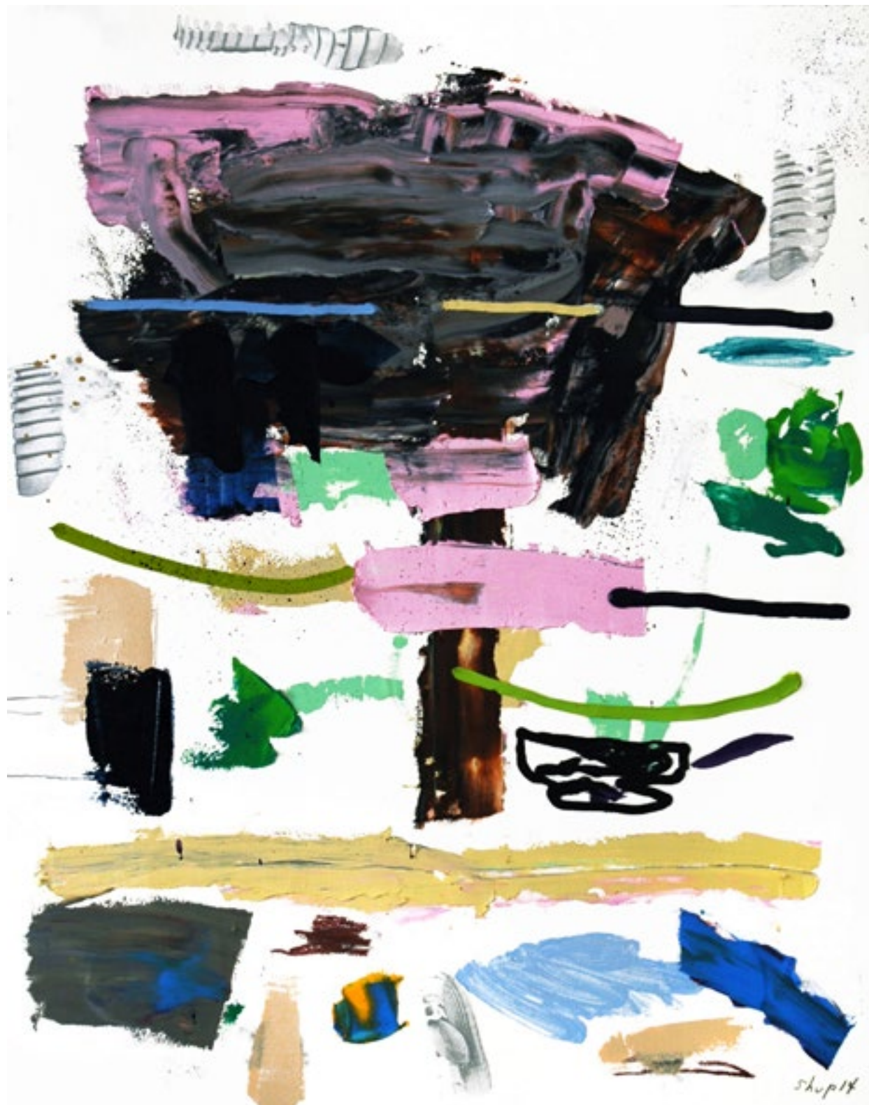
PUNKY, 2014, huile sur papier arches, 76x56 cm

I was painting quickly, mostly with water-based paint, india ink and big brushes I had bought in China. I'd pin the large paper paintings on the wall and scatter them on the floor to dry until there'd be no more room in the studio. Every morning I'd review them, select some finished works, and add layers to rework others. I spent about six months doing this. It was very liberating; my arm, my eyes and my mind's eye got good exercise.