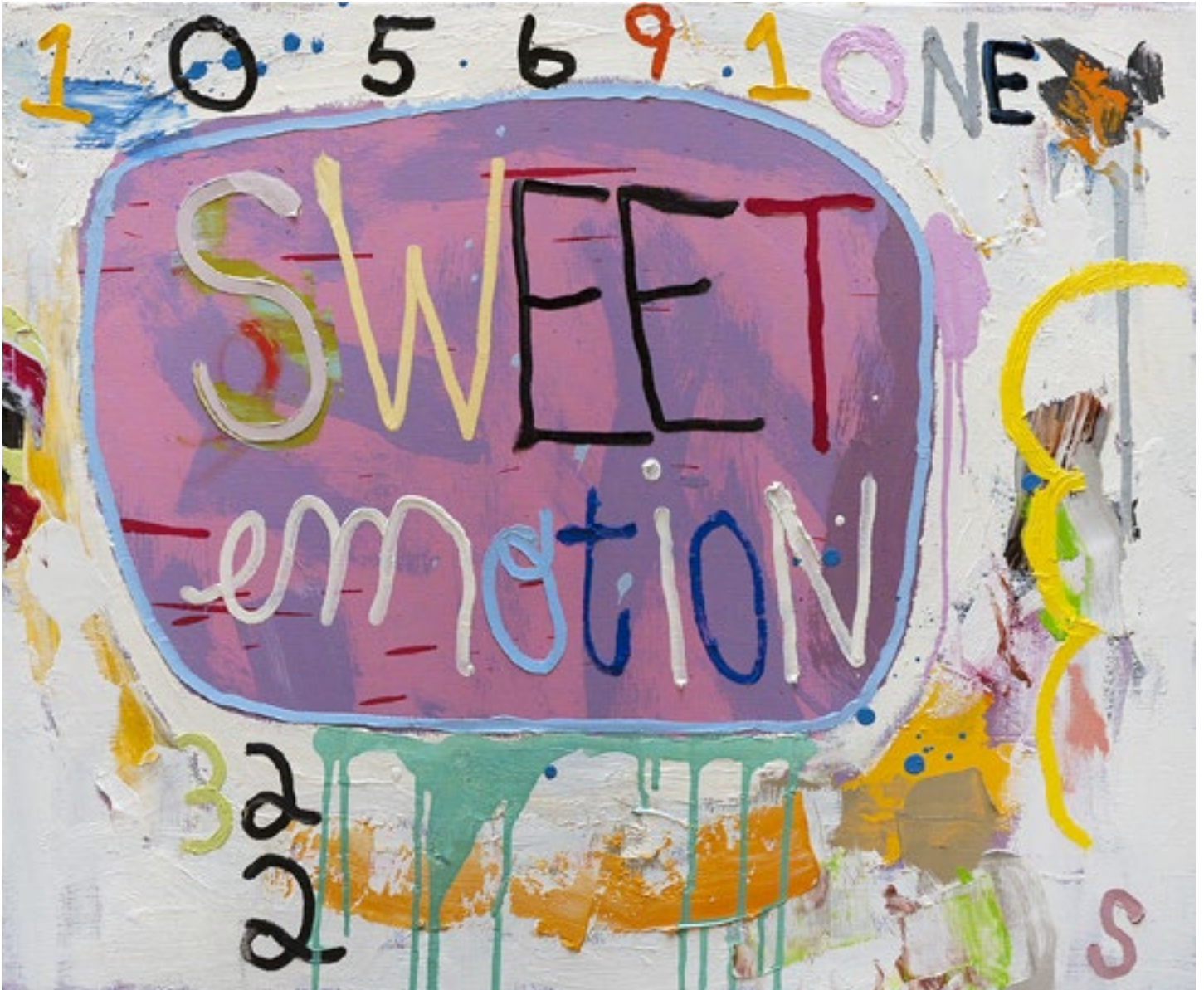
SWEET EMOTION, 2012, huile sur toile, 60x73 cm