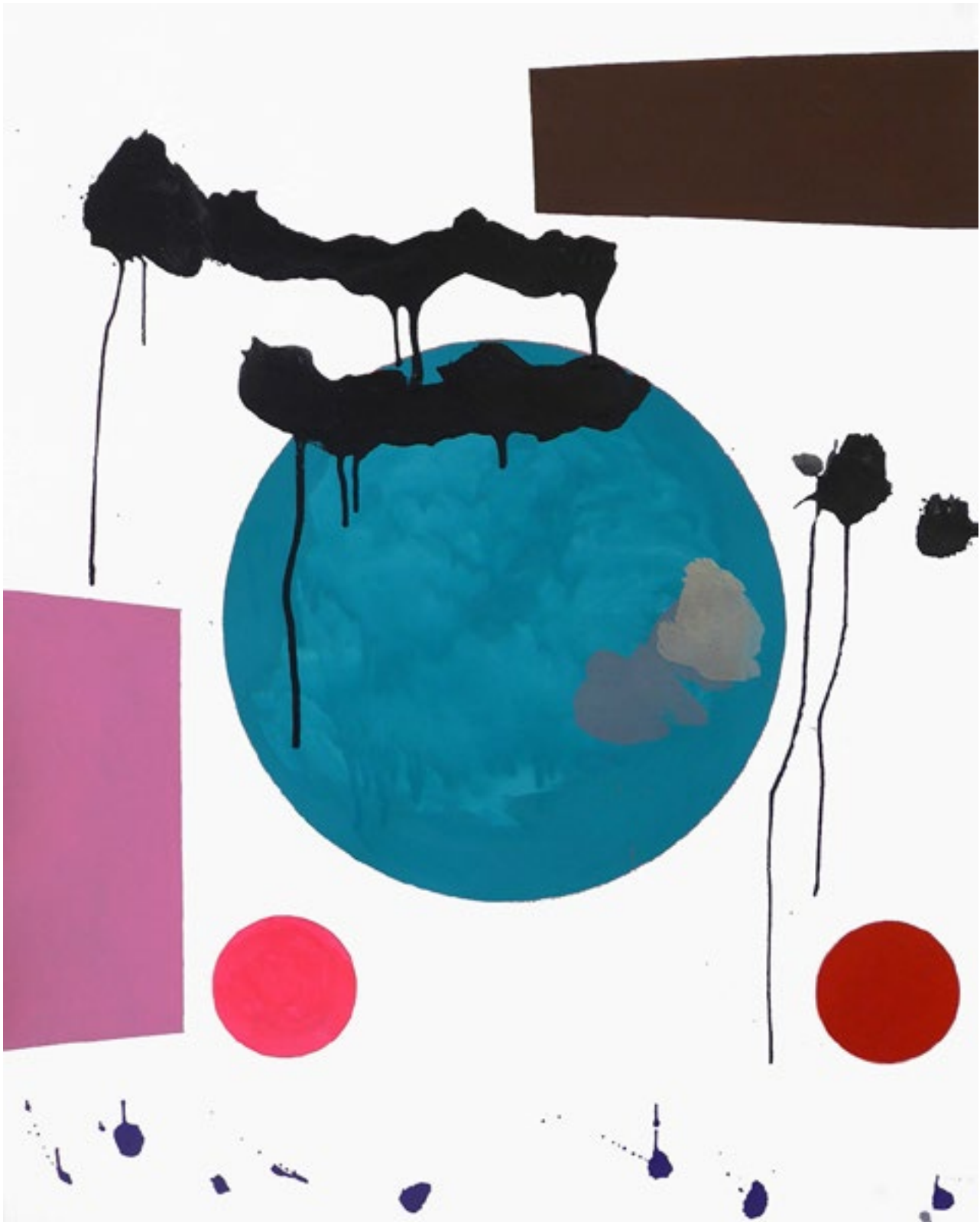
RETURNING, 2015, mixed media on paper, 100x80 cm

7, rue Charles Fournier - 63400 Chamalières SARL Cosmo Fine Art . SIRET : 75073873400011 . TVA : FR83750738734 contact@galerielouisgendre.com - www.galerielouisgendre.com